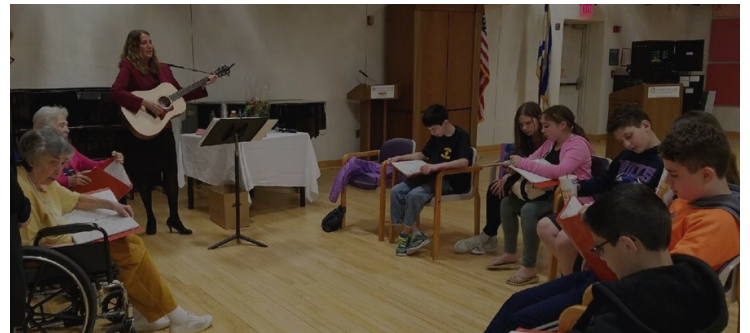
Our 6th graders with their adopted Grandparents at Gurwin.