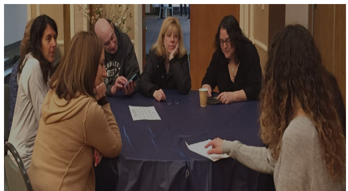
6th grade PACT preparing for the debate.