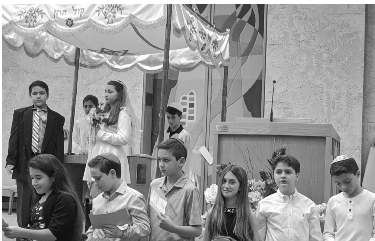
5th Grade Wedding