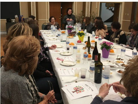
Enjoying the Tu B'Shevat Seder.

We wish you and your family a wonderful Passover