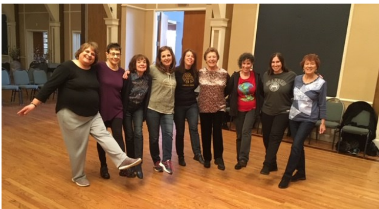
Israeli Dancing on a Sunday afternoon at Temple Beth David.

SAVE THE DATE!!! FASHION SHOW MONDAY, MAY 6TH 7:00 P.M.