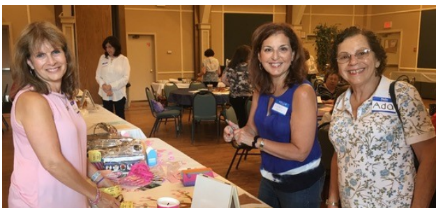
Sisterhood’s Welcome Back Brunch