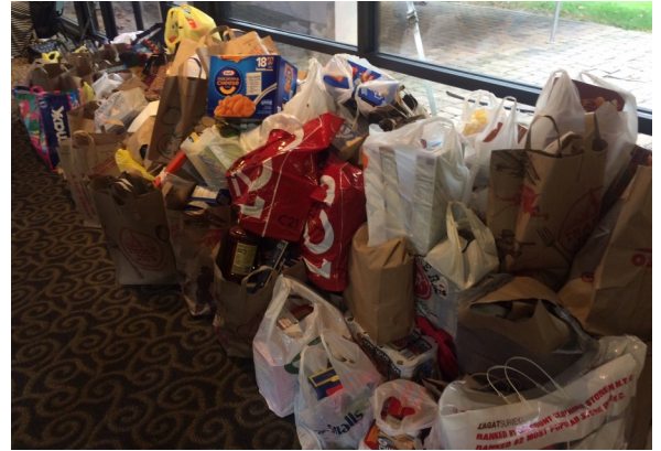
TBD Yom Kippur Food Drive

The Isaiah 58 Committee wishes you all a healthy, Happy Thanksgiving!