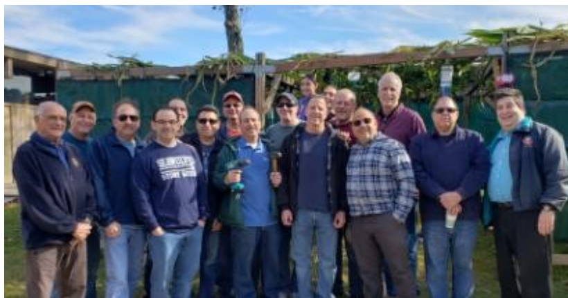
The Brotherhood Sukkah Construction Crew and the finished project