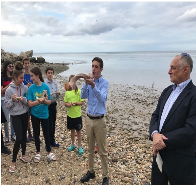
Tashlich at Kings Park Bluffs on Rosh Hashana