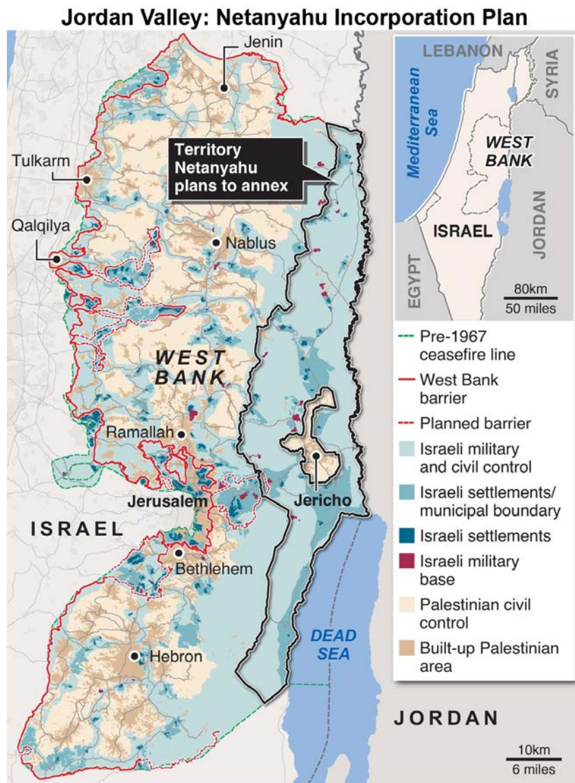
Map credit: Graphic News

Control of the Valley ensures Israel's ability to reliably detect and intercept terrorists, smugglers and others seeking to infiltrate either the West Bank or Jordan, thereby ensuring any Palestinian entity – including a possible future state – would remain demilitarized, which any Israeli government would insist upon. For example, Jordanian troops and armor invaded through the Valley when Israel did not control the area in 1948 and 1967, but notably refrained from attacking when Israel controlled it during the 1973 Yom Kippur War. Israel's experience with Gaza further underscores this imperative. It controlled a strip along the Gaza-Egypt border called the Philadelphi Corridor, which enabled the IDF to intercept cross-border weapons smuggling both ways between Gaza and Sinai. Upon leaving Gaza in 2005, the IDF also left this buffer zone, leading to drastically increased rocket fire on Israeli population centers, including wars in 2008-09, 2012 and 2014.