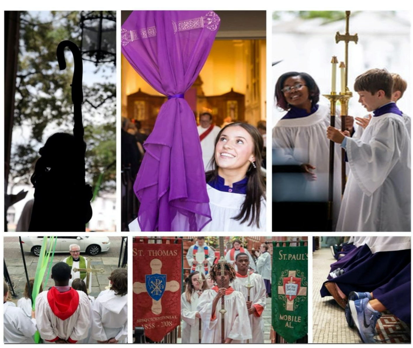
Connect with the Episcopal Diocese of the Central Gulf Coast

Saturday, August 23 8:30 a.m. to 3:30 p.m. Christ Church Cathedral 115 S Conception St, Mobile AL