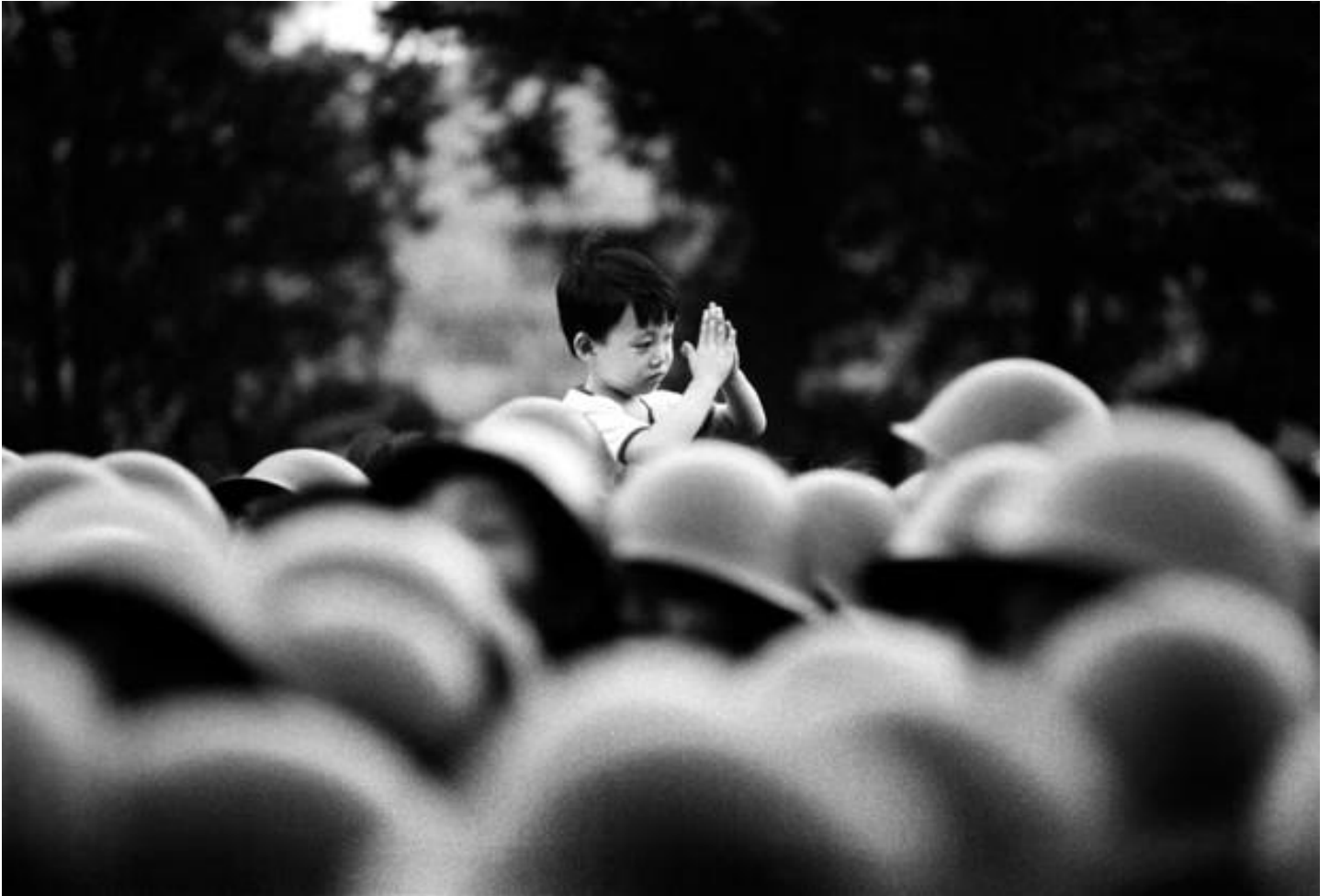
Tiananmen Square, 1989, Photograph: Dario Mitidieri

Church of the Holy Nativity, Honolulu, HI 5286 Kalaniana'ole Highway Honolulu, HI 96821 www.holynativityhawaii.org