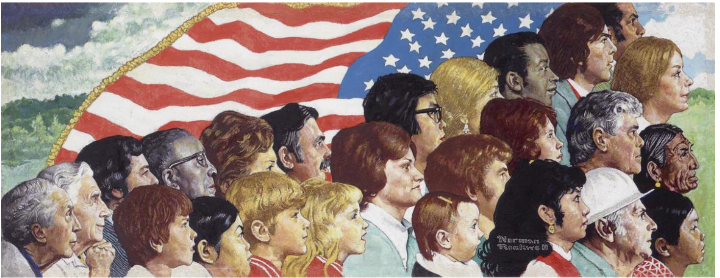
Norman Rockwell, artist

Church of the Holy Nativity, Honolulu, HI 5286 Kalaniana'ole Highway Honolulu, HI 96821 www.holynativityhonolulu.org