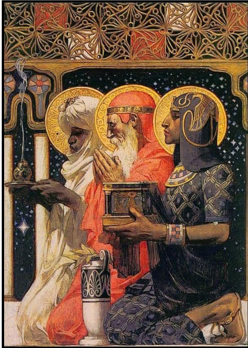
Joseph Christian Leyendecker, artist

Church of the Holy Nativity, Honolulu, HI 5286 Kalaniana'ole Highway Honolulu, HI 96821 www.bolynativityhawaii.org