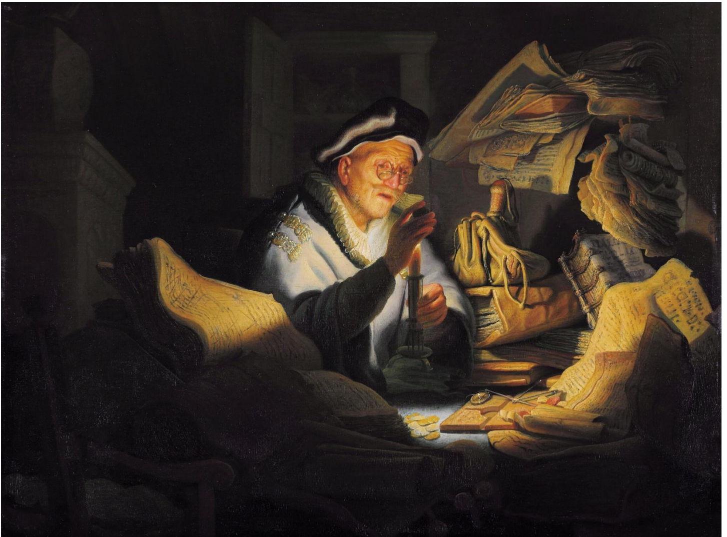
The Rich Fool / Rembrandt, artist

Holy Eucharist Sunday, August 3, 2025 at 9am