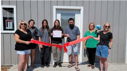
Prado's Trading Post