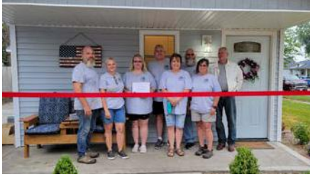
2x4s For Hope