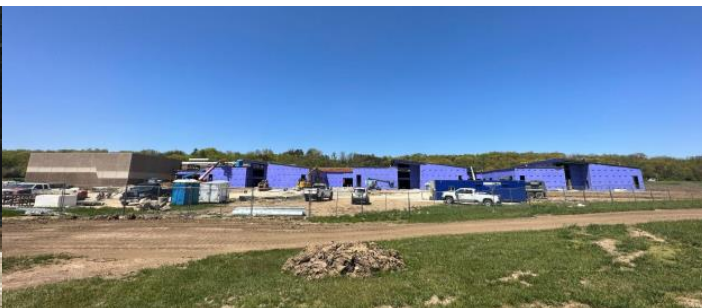
FM Middle School New PK-3