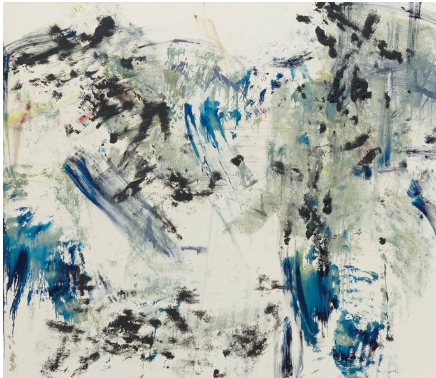
Louise Fishman, Like Air I'll Rise , 2018, oil on linen, 74 × 86".

That was her kind of politics and her kind of love: Start with your own struggle, look to the surrounding world to figure out your community, work out your relational lifelines by means of what you love, maintain an attitude of remembrance but noncompliance.