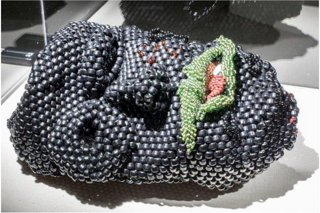
Sculptures addressing racism include "Rodney King's Head Was Squashed Like a Watermelon," from 1991.