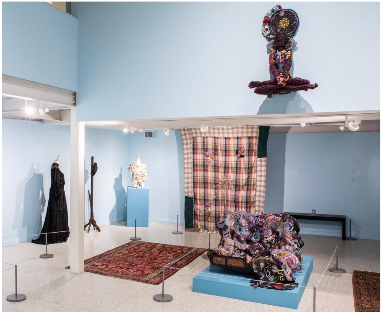
A view of the “Harriet’s Closet” installation, which is presided over by a glass-beaded portrayal of Tubman as a haloed Buddha, seated in full lotus position and spilling jewels from her hands. An elegant black dress from around 1900 and recent works are also part of the display.