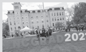
Photo Station 2: Old Main lawn, three blocks north of Chicago Ave. on Brainerd St.