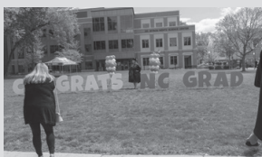
Photo Station 1: Jefferson Lawn, one block north of Chicago Ave. on Brainerd St.

Don't forget to capture the moment and take photos of your grad at our three photo stations on campus.