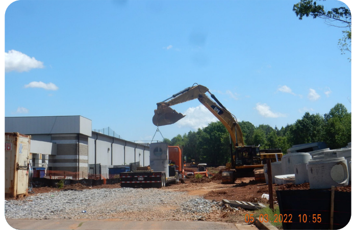
Equipment delivery and site staging May 2022