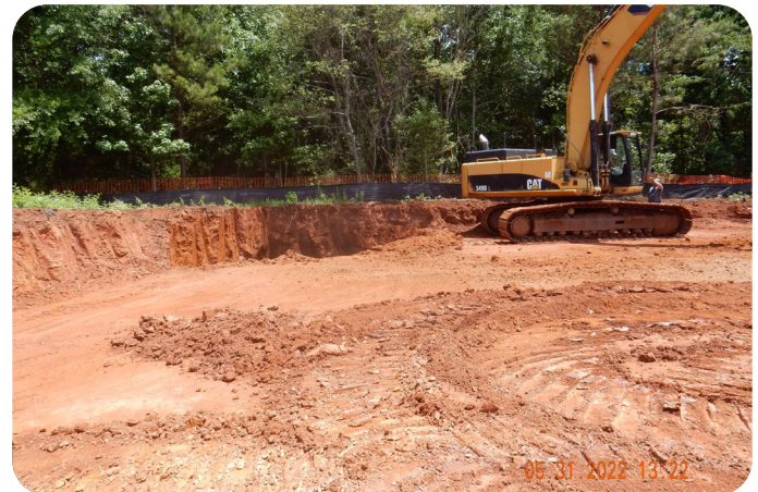
Site clearing and grading May 2022