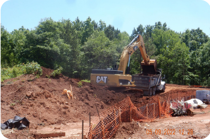
Site clearing and erosion control measures May 2022