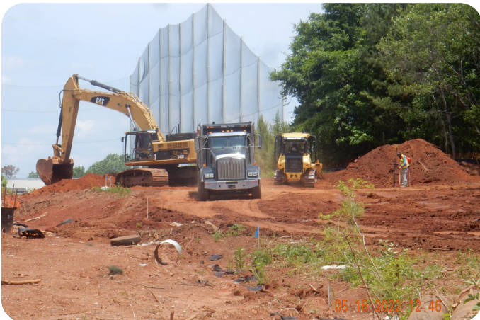
Site clearing and grading adjacent to Topgolf property May 2022