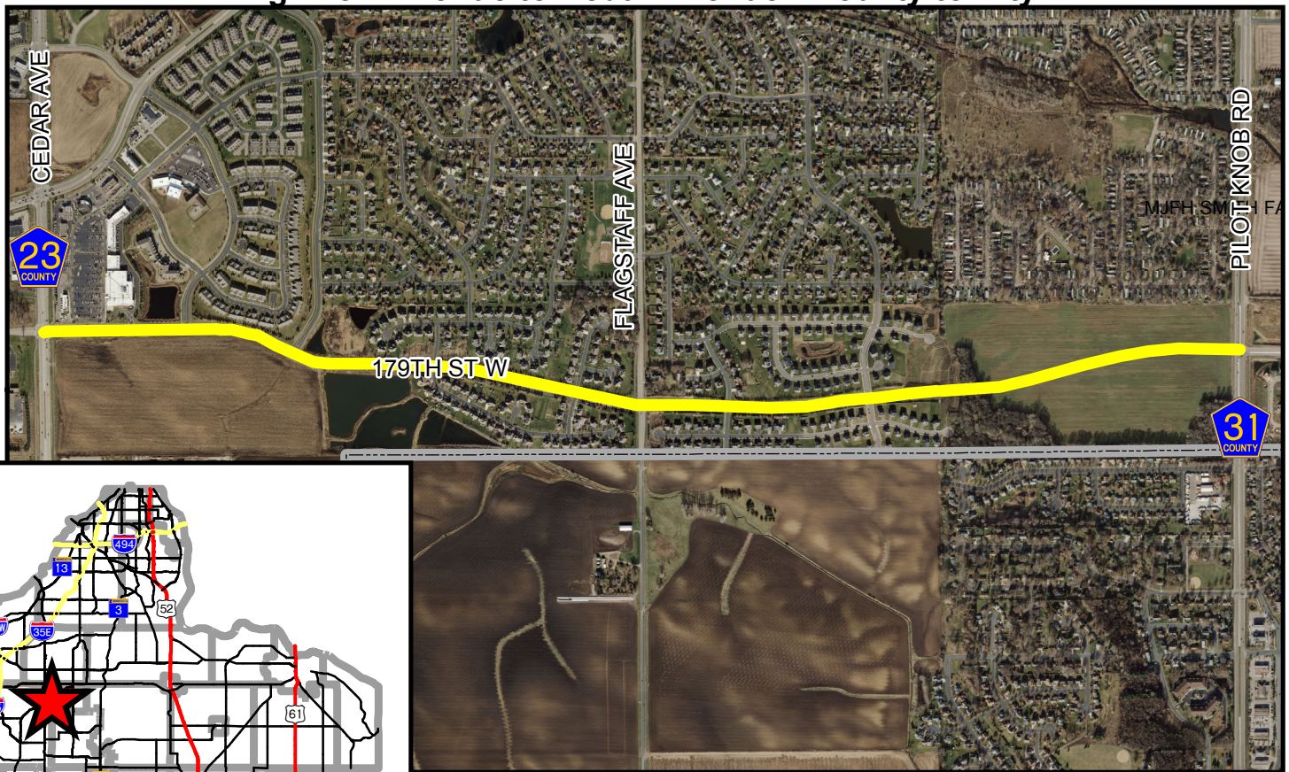
179th Street West to Pilot Knob Road - City to County

Prepared by the Dakota County Transportation Department