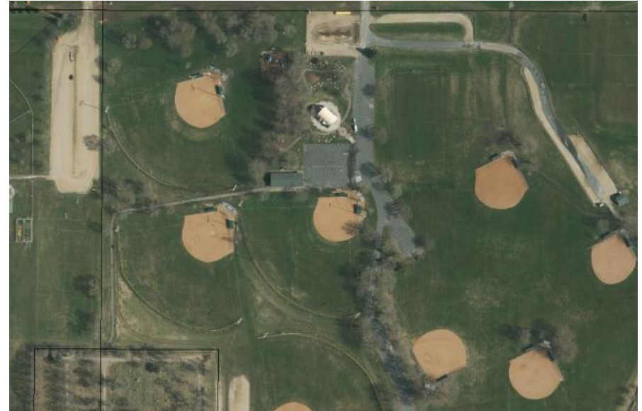
Parking Lot Improvements Aronson, Quigley-Sime and Dodd Trail