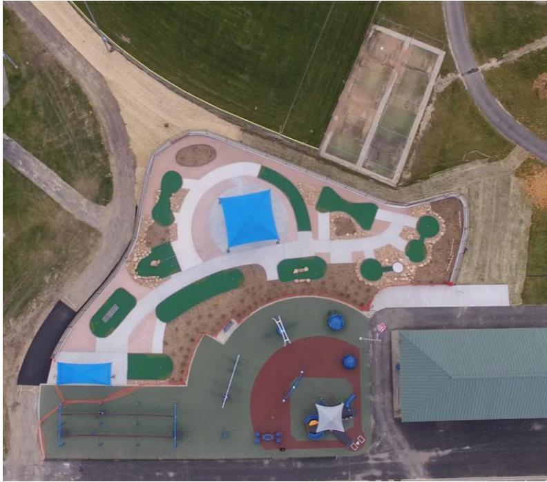
King Park 9 Hole Handicapped Accessible/All Inclusive Mini Golf Course