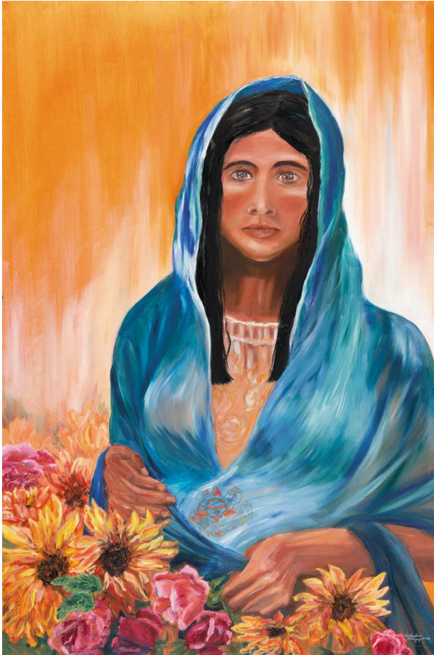
La Morenita del Tepayac /Our Lady of Guadalupe 24 x 36 " / 62 x 92 cm. @

Oil paintings on canvas by Barbara Paleczny SSND: