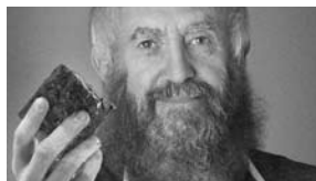
Dough 8:30pm Thursday, April 28