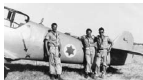
Above and Beyond 6:00pm Wednesday, April 27

A collaboration between three of Rochester’s largest film festivals will highlight the “best” movies to a broader film-loving audience. This mini-festival will run three nights at The Little Theatre on Wednesday through Friday, April 27, 28, and 29, with each festival showing two standout movies.