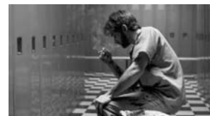
The Lennon Report 8:30pm Friday, April 29