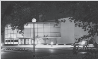
The spacious Eisenhart Auditorium complex will be the site of this year's Fair.

Rochester Museum & Science Center Eisenhart Auditorium 657 East Ave, Rochester, NY 14607