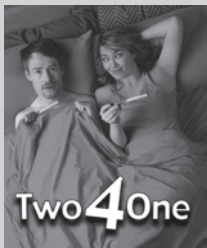
Two 4 One is a bittersweet comedic drama that sees a transgender hero in an unimaginable predicament.

Pedestrian Drive-In in the Spiegelgarten (next to the Spiegeltent at One Fringe Place)