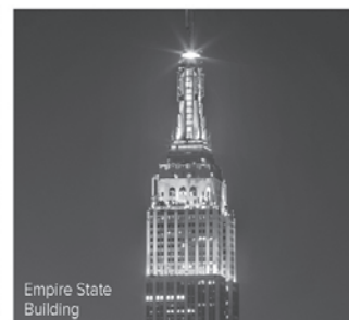
Empire State Building

Plan your New York State getaway at iloveny.com/lgbt