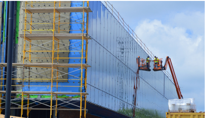
Workers complete the finishing touches on the the windows on the north wall along the walking/jogging track. The track offers stunning views of Orillia's beautiful downtown.

The City has been making proactive financial plans for the opening of the Orillia Recreation Centre for several years. Starting in 2013, Council began setting aside funds as annual reserve contributions in order to gradually phase in the operating costs of the facility over a period of years. This avoids a large single-year increase when the facility officially opens as the operating costs have already been built into the City's budget.