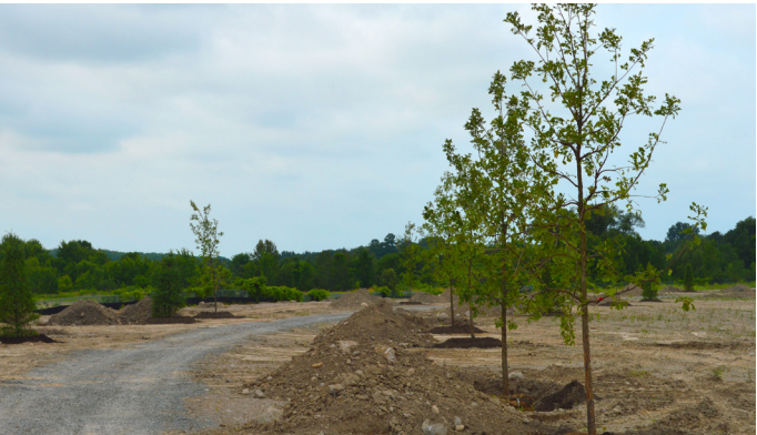
Tree planting is being completed throughout the 36-acre Foundry Park site, including trees and shrubs in the parking lot and along the walkway and boulevard leading into the building.