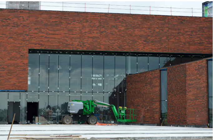
The courtyard area at the rear of the building is taking shape. This outdoor area is adjacent to the multi-purpose rooms and will feature benches, tables and landscaping to enjoy the outdoors.