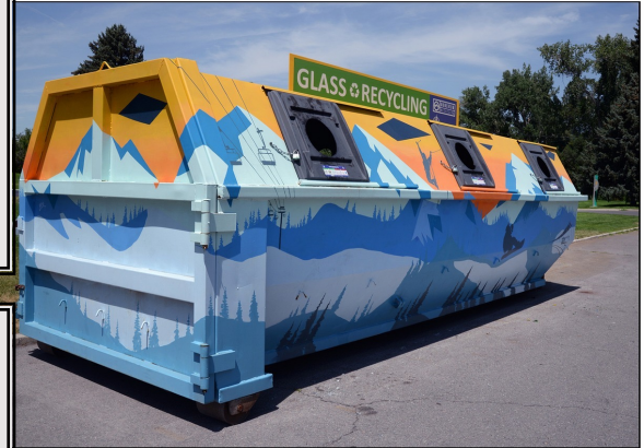
Sugar House Park- Mural on glass recycling dumpster