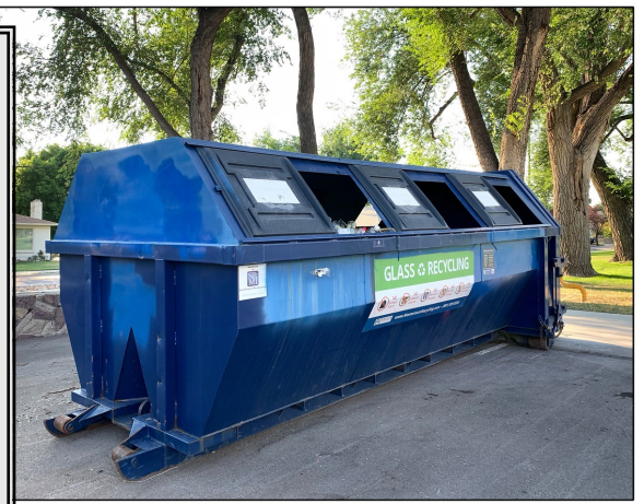
Fairmont Park- unpainted glass recycling dumpster