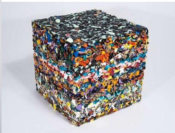
Cube - Layered Acrylic chips