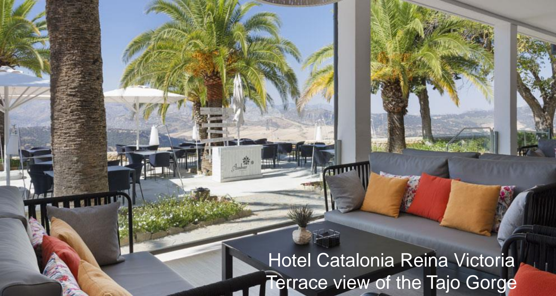
Hotel Catalonia Reina Victoria Terrace view of the Tajo Gorge