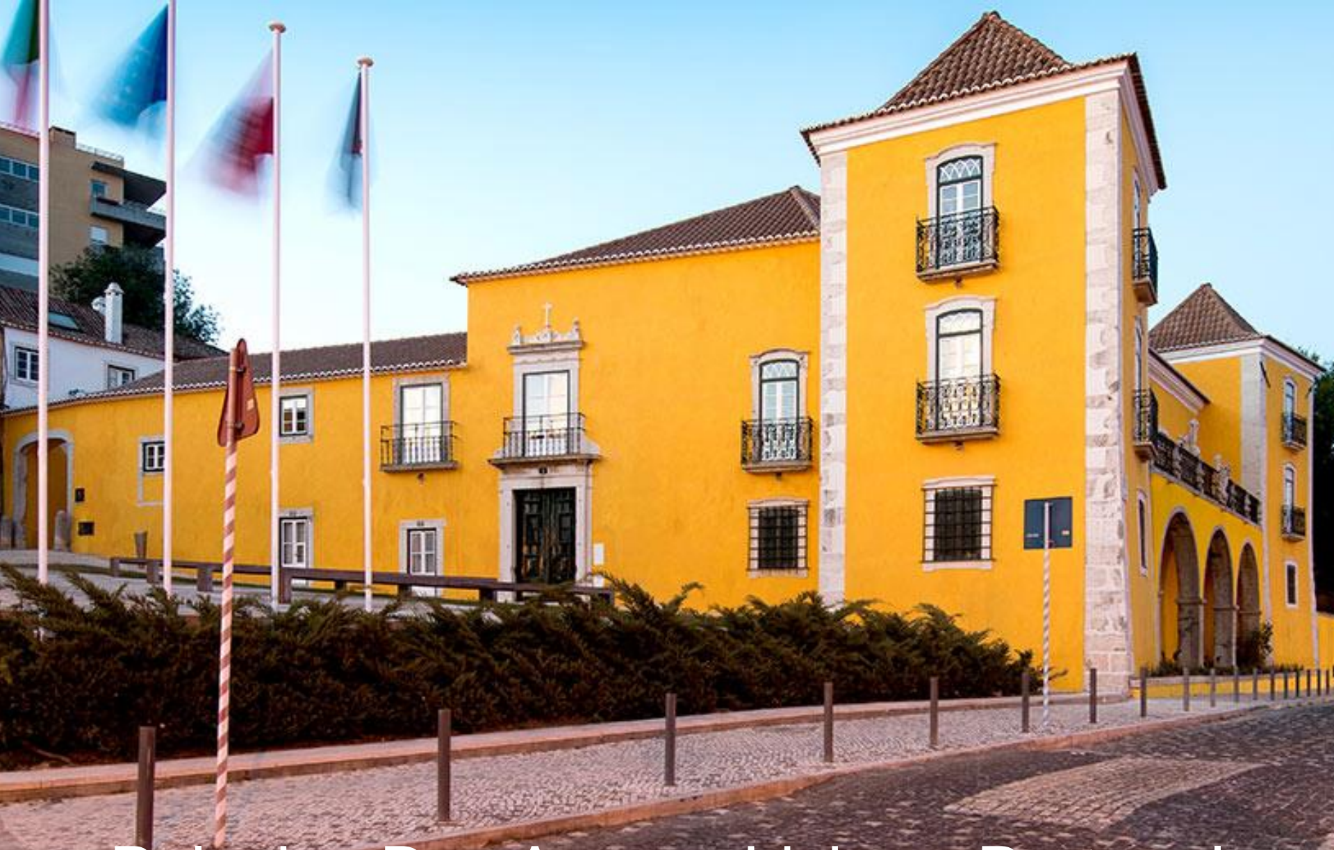
Palacios Dos Arcos - Lisbon, Portugal Sunday and Monday nights, Days 2-3