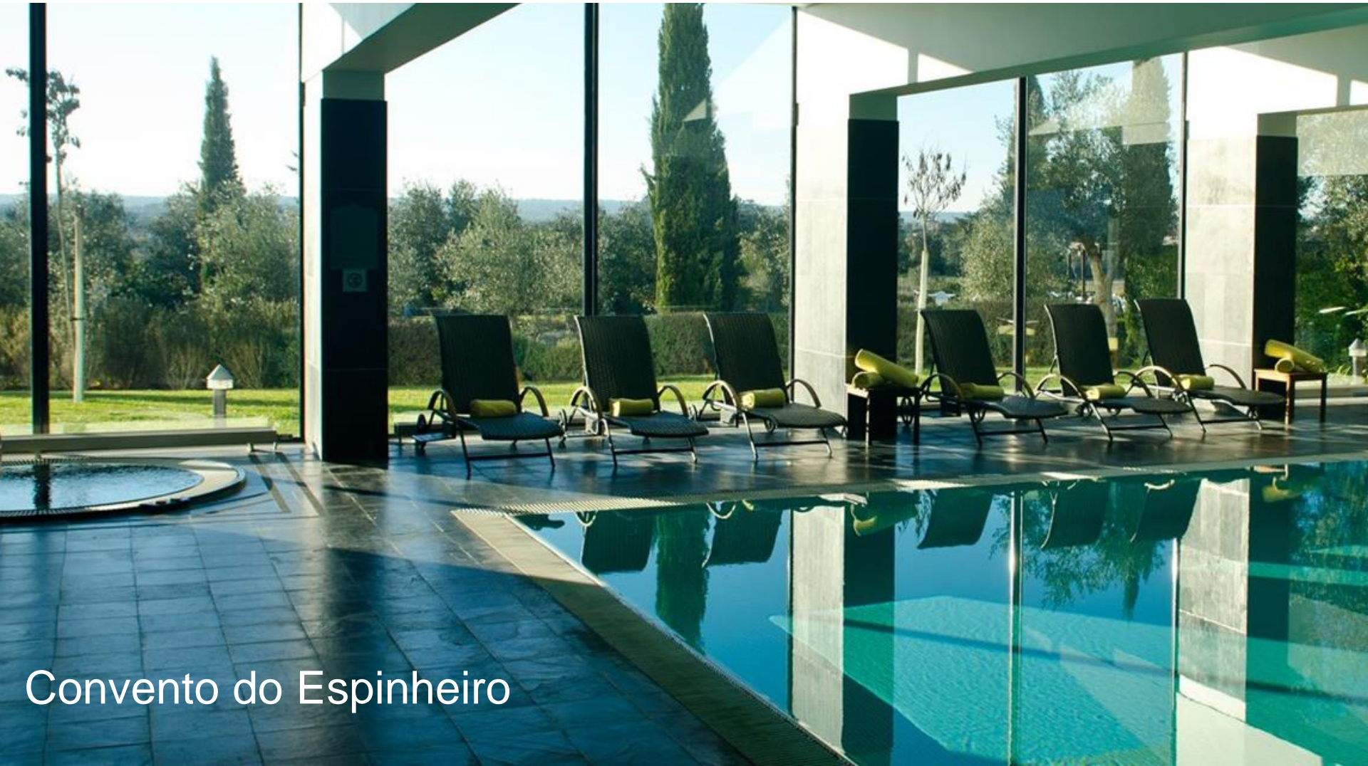
Convento do Espinheiro