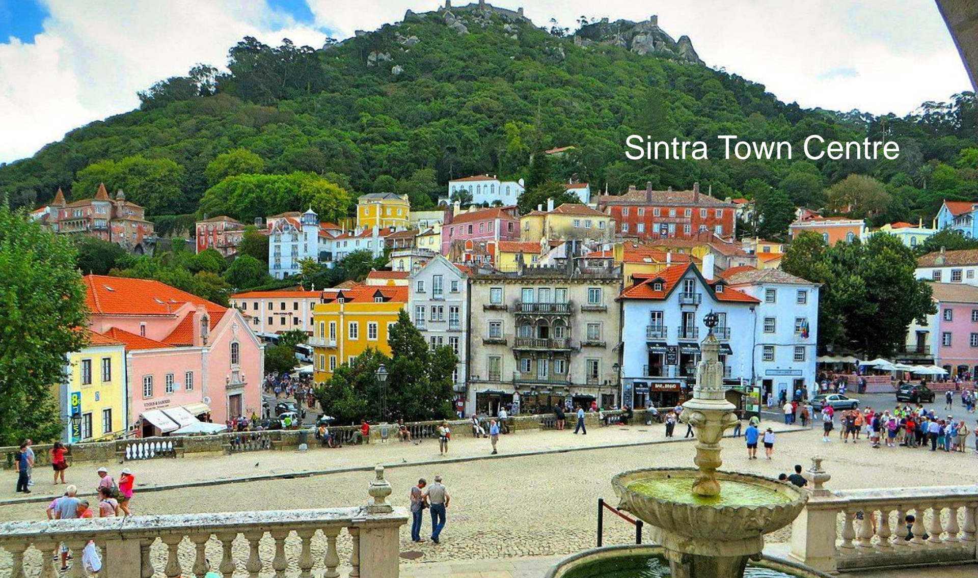
Sintra Town Centre