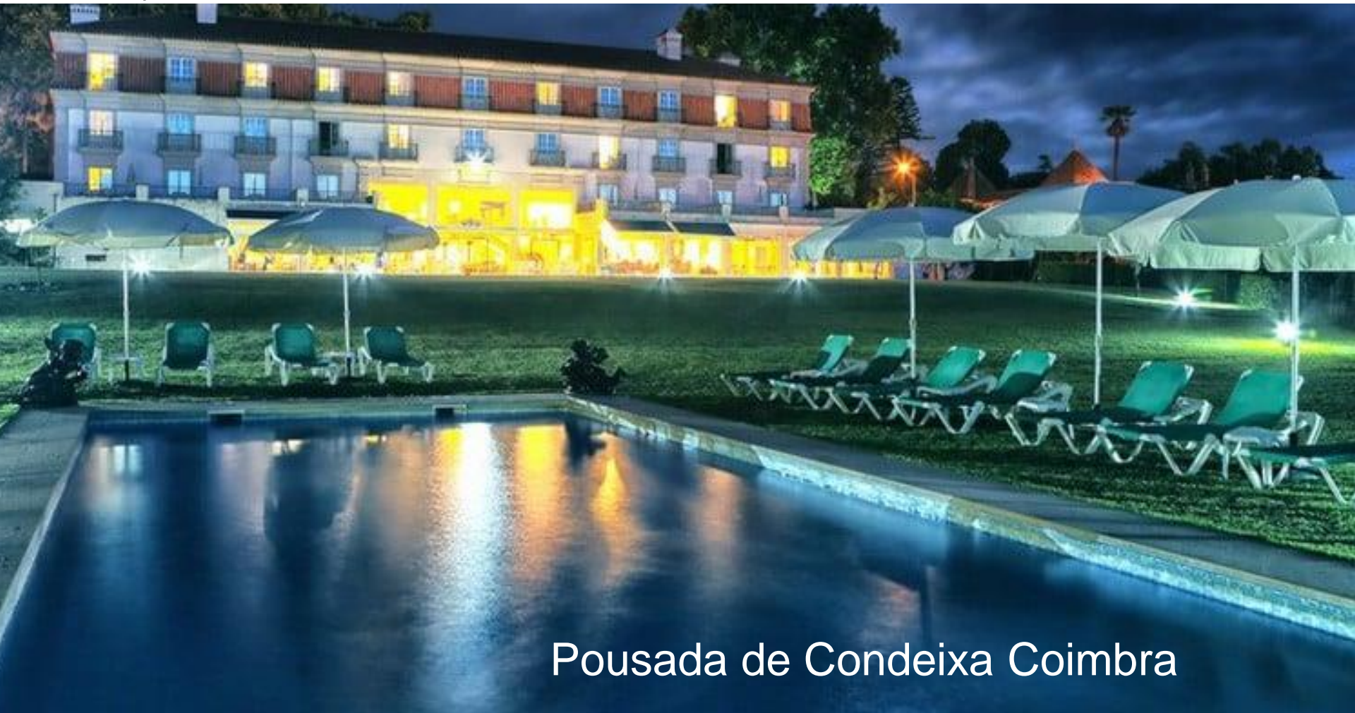
Pousada de Condeixa Coimbra