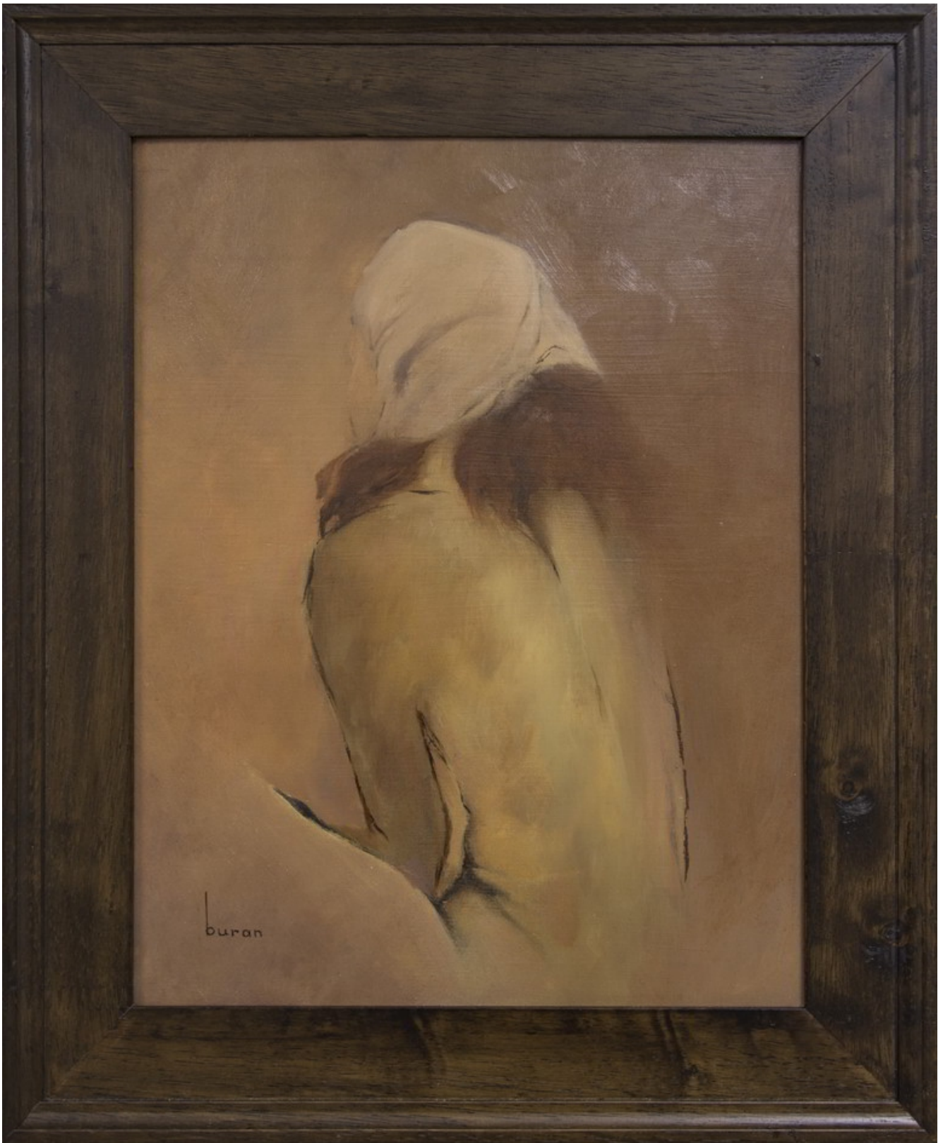
"Contemplations" by Charlene Buran Price