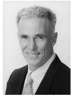
Dr. Doug Phillips

Suramin Use for Autism and Cancer 4:05 Cancer 5:31 Plastics & Nanoparticles- Environmental 8:32 Prions – wild deer infected 17:00 Light and the Human Biofield 49:04 Photon Wave Treatment 52:35 All emotional memories are color coded 53:17 Visual Field – we can measure for brain function 55:00 PhotoPheresis