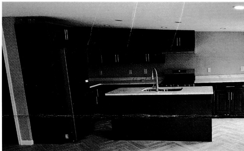
128 Main Street