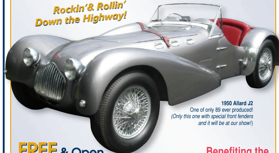
1950 Allard J2 One of only 89 ever produced! (Only this one with special front fenders and it will be at our show!)