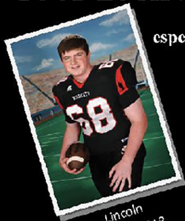
Lincoln Class of 2018