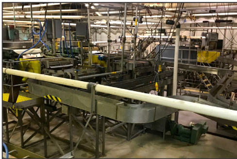
CHERRY & APPLE GRADING & WASH