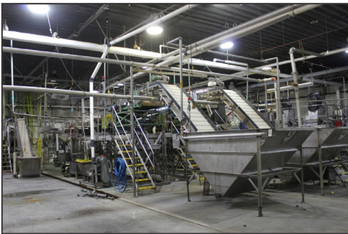
CHERRY & APPLE RECEIVING LINES