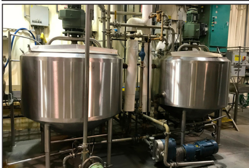
STAINLESS PROCESSING & STORAGE