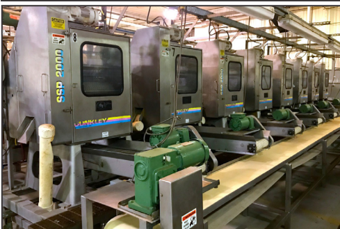
20+ DUNKLEY PITTERS