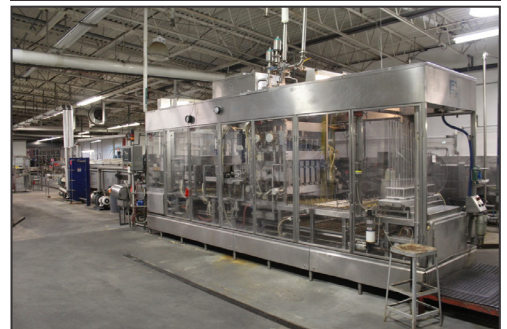
COMPLETE CUP FILLING LINE