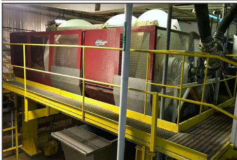
(2) BUCCHER JUICE PRESSES