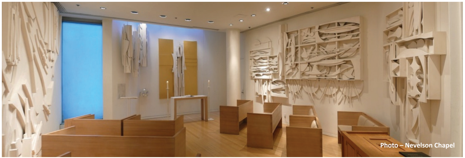
Photo – Nevelson Chapel