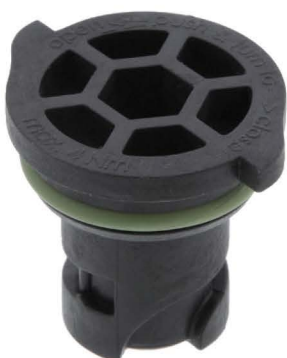
Drain Plug (Top View)

PAI's Drain Plugs are thoroughly tested to ensure optimum fit and performance on specific vehicle applications. This replacement Drain Plug fits Paccar MX-13 Oil Pan OEM 2154313PE, and replaces OEM Plug 1982821PE.