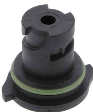
Drain Plug (Bottom View)