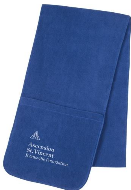
FLEECE SCARF WITH POCKETS

Silver $260-$519 Donation in a 26 week time period