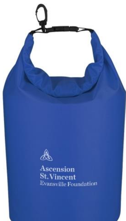
WATERPROOF DRY BAG WITH WINDOW

Made Of 100% Polyester Fleece 9" Deep Pockets On Ends