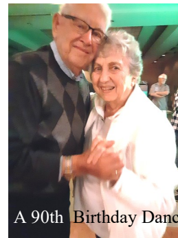
A 90th Birthday Dance