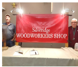
Silveridge WOODWORKERS SHOP