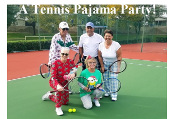
A Tennis Pajama Party!