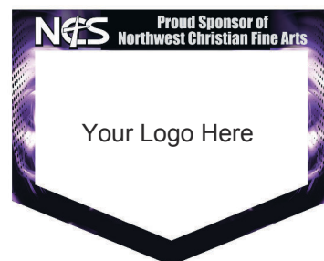
Outdoor Banner: 4' x 5'