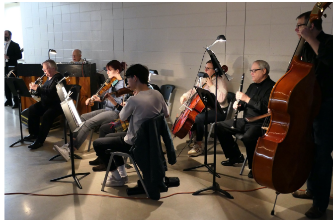
Thanks to our musicians from the December caroling event presented by Adult Ed!