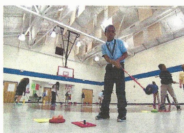
Elementary Schools experiencing our National School Program