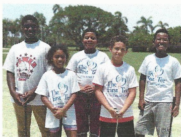
Participants from the Banner Lake Program enjoying Jupiter Island Club