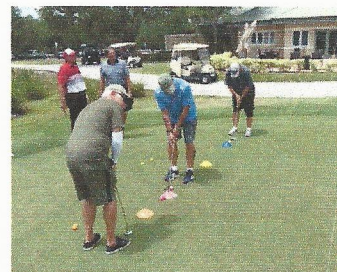
Veterans at our Champions Club Program

Thank you for supporting our mission and programs. We sincerely appreciate your support and your donation of $3275.57. We continue to grow each year and deliver The Life Skills Experience of The First Tee to more and more students in the Treasure Coast. We look forward to your continued support of our golf and youth development programs.