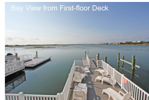
Bay View from First-floor Deck