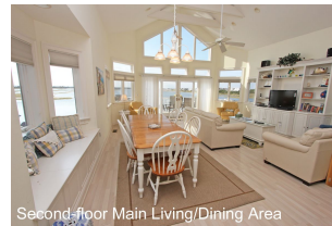
Second-floor Main Living/Dining Area