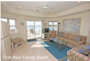
First-floor Family Room