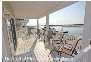
Deck off of First-floor Family Room