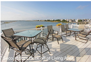
Second-floor Deck off of Living Area