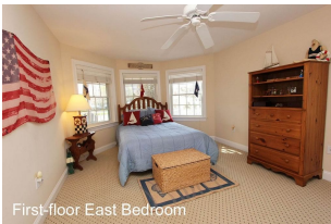
First-floor East Bedroom