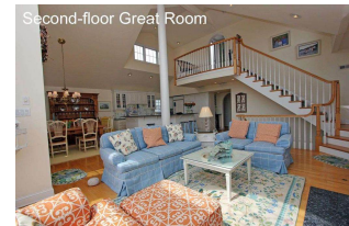
Second-floor Great Room

Remarks Striking three story upside down style home on a premium corner lot with direct access to Avalon's best beach. Beautiful architectural windows allow the home to be flooded with natural sunlight. The second floor great room has soaring, vaulted ceilings and an easy flow to the oversized, east facing sun deck. The third floor private deck allows a wonderful sunset view. There is ample room for pool.