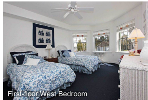
First-floor West Bedroom