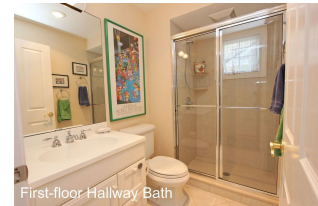
First-floor Hallway Bath