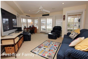
First-floor Family Room