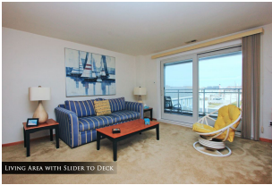
LIVING AREA WITH SLIDER TO DECK

Sold Price Closing Date 2/28/2020 Contract Date 1/28/2020