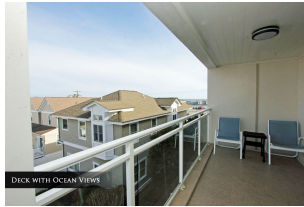
DECK WITH OCEAN VIEWS