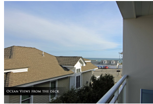
OCEAN VIEWS FROM THE DECK