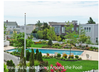
Beautiful Landscaping Around the Pool