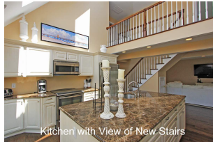
Kitchen with View of New Stairs