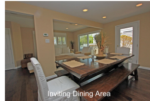
Inviting Dining Area