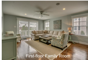
First-floor Family Room