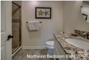
Northeast Bedroom Bath