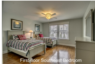
First-floor Southeast Bedroom