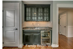
Family Room Wetbar