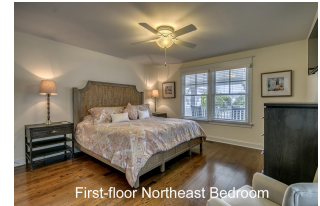
First-floor Northeast Bedroom