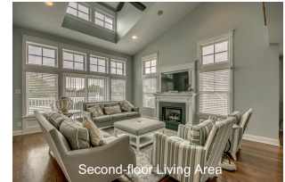
Second-floor Living Area

This custom home located in the south end of Avalon exemplifies clean coastal style, airy elegance and is outfitted with unsurpassed quality detailing throughout. Custom moldings, backsplash, hardwood and tile floors, the four-stop elevator, expansive rooms, commanding master suite, and sparkling in-ground pool make this home an opportunity not to be missed. The spacious first-floor family room complete with a wet bar was meticulously appointed with gorgeous cabinetry, granite sink tops and a slider to the pool for easy access to fun and relaxation. The sophisticated interior & exterior SONOS home system that can be controlled directly from your phone, and vast entertaining space equipped with high vaulted ceilings and spacious decks on the second floor set the tone for indoor/outdoor entertaining. Elegantly styled for culinary pursuits, the chef's kitchen includes a marble island counter, high-end appliances, a walk-in pantry and elegant counter seating. Your guests are sure to enjoy their meals in the formal yet comfortable dining area. Retire at the end of the day to the luxurious third-floor master