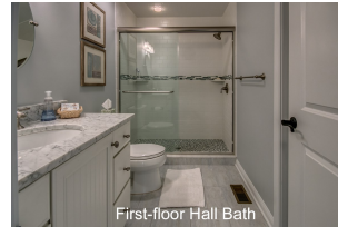
First-floor Hall Bath