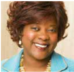
Loretta Devine, Actress Movies, Film & Stage Award