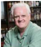
John Morris Lifetime Achievement Award