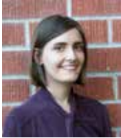
Jennifer Dixon Service & Volunteerism Award