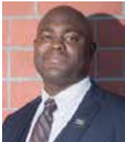
Dr. John Hamilton Education Award