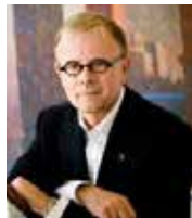
Ron Nelson Art & Culture Award