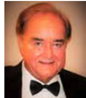
Ken Miller Humanitarian Services Award