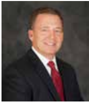
Mike Van Dyke Community Service Award