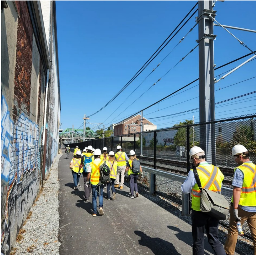
The tour of the CPX began at the GLX's East Somerville station and followed the right-of-way northbound along some walls ripe for murals

Friends of the Mystic to Charles were provided a sneak peek of the Somerville Community Path Extension (CPX) during NACTO's 2022 Designing Cities Conference in early September. The path, critical to connecting communities north of the Mystic and Charles Rivers to Downtown Boston, will be ready for use once the Medford Branch of the Green Line Extension opens (currently scheduled for November, 2022) and the City of Somerville assumes its operational oversight. See below for a few photos from the tour: