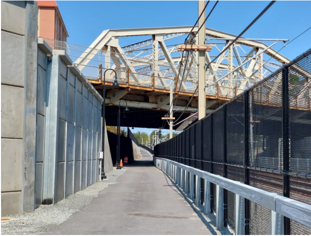
Retaining walls and the overpass at McGrath Highway. Staying at-grade level allowed the path to remain in the GLX project budget