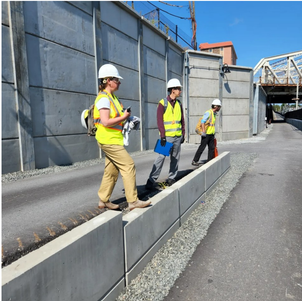
Members of the GLX project team and City staff provided their perspective on the project while stopping at the Cross Street ramp entrance