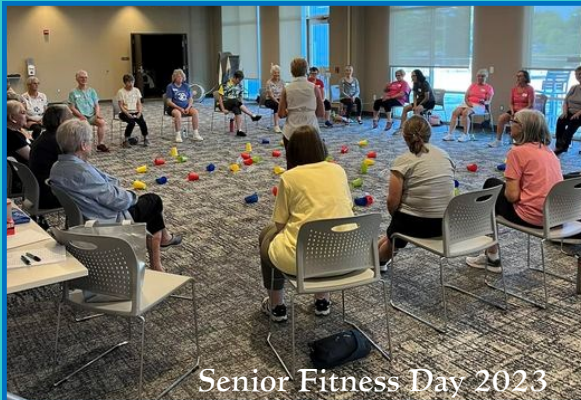
Senior Fitness Day 2023

Indoors or out, we keep moving and grooving @ LCAL! The heat & humidity offer a perfect excuse to come inside and get/stay active. Check out all our summer offerings in the newsletter!