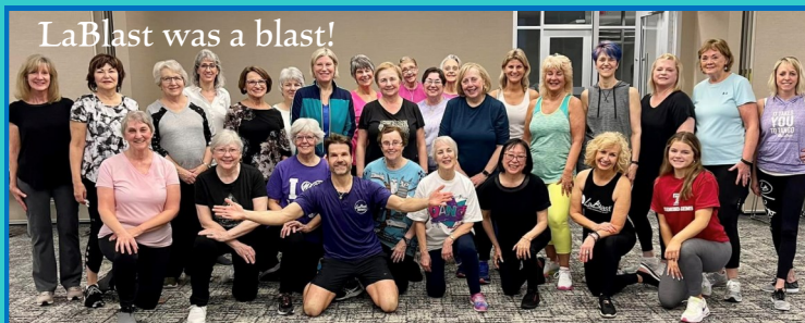
LaBlast was a blast!