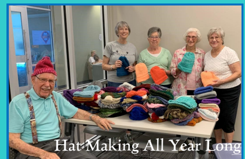
Hat Making All Year Long

Beauty on display at Leader Center for Active Life