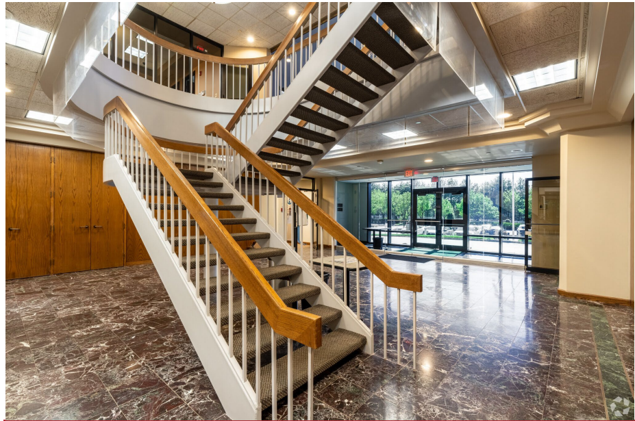
Impressive lobby features include two story entryway, marble flooring, ornamental stairway and custom woodwork.