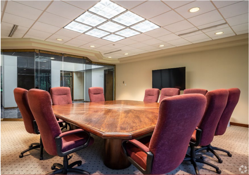
Training/Conference Facility Available