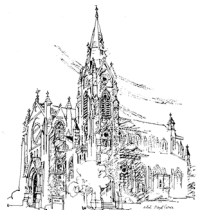
Corpus Christi Catholic Church