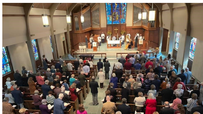
All Saints Sunday at Hayes Barton