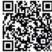
This Is My Father's World (song)